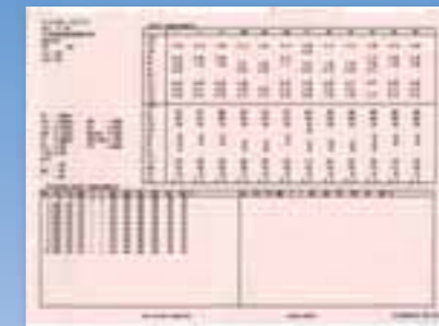
Detailed measurements report