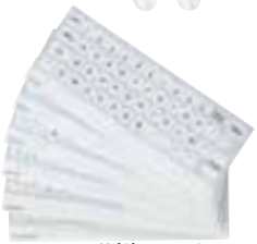
Multi language sheet

Full Qwerty keyboard is provided as standard. This facilitates the input of patient names, etc. (Besides English, the keyboard is available in five languages.)