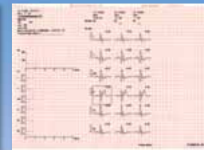
Post-exercise summary report