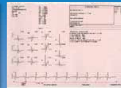
Analysis result report