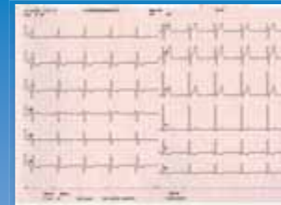
Automatic waveform report (6chx2)